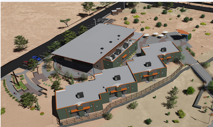
*Rendering courtesy of Swaim Associates